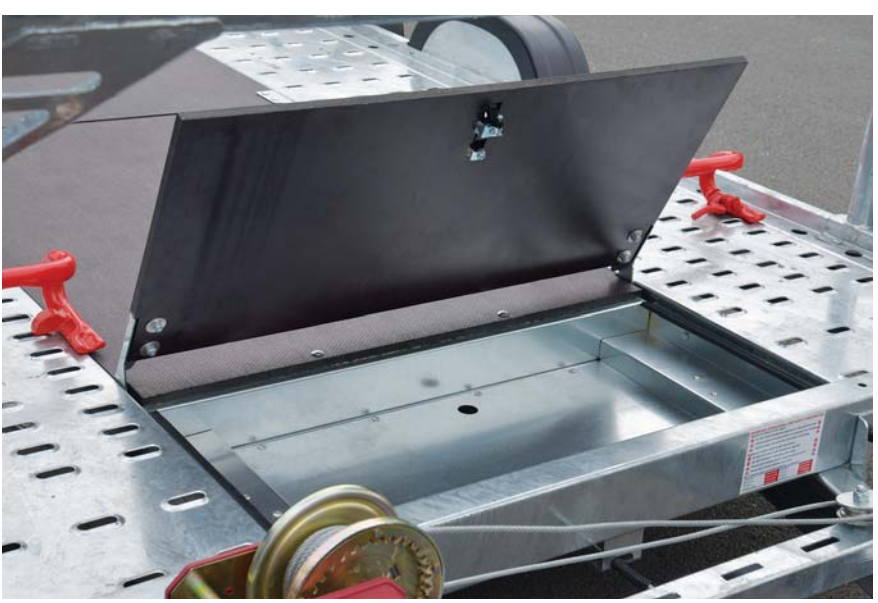
• Storage bed locker (front) Lockable front storage locker, with automatic lift lid.