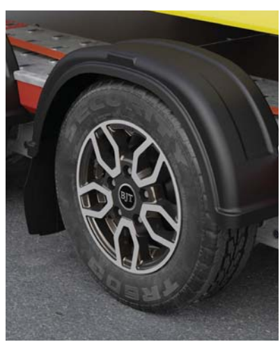
O Alloy wheels A Transporters are also available with alloy wheels in standard Silver or diamond-cut Anthracite (Anthracite shown).