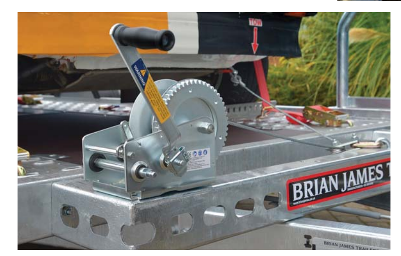
O Manual winch + 3 point adjustable pull positions.